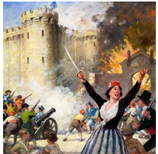
Storming of the Bastille

The plan of attack was to storm the Bastille, not to release hundreds of “oppressed political prisoners” supposedly imprisoned there, but to capture the needed weapons to start the revolution. This was confirmed by the fact that, when the mob reached the Bastille, so-called “torturous” prison of the “oppressive” King Louis XVI, there were only seven prisoners incarcerated there: four forgers, two lunatics, and the Comte de Solages, incarcerated for “monstrous crimes against humanity” at the request of his family. “The damp, dark dungeons had fallen into complete disuse; since the ministry of Necker in 1776 no one had been imprisoned there.