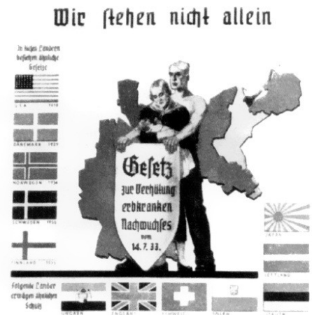
NAZI Eugenics Poster

Most Americans do not understand the extent to which such thinking influenced both government policies and society in the United States in the early twentieth century. It is not uncommon to hear of such elitist doctrines when the subject of Nazi Germany and Aryan superiority is discussed. Yet, few discern how the very same elitist beliefs had infiltrated and spread throughout the United States prior to the war. In fact, Adolph Hitler obtained many of his ideas from, and expressed admiration for, many of the leaders of the Eugenics movement in America.