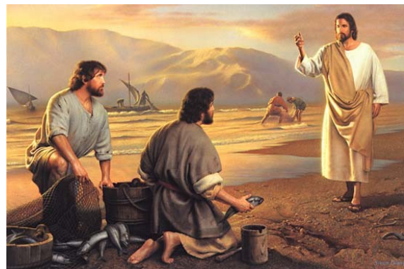
Yahshua Calling His Disciples

John echoes the words of Christ in the gospel that he penned. He states that the disciples “bear witness” to Yahshua. He specifically says the witness is of that which they “beheld.” John does NOT say that the disciples beheld Christ in ages prior to His coming to earth, or that they walked with Him in realms that are celestial before this present age. The disciples of Christ bore witness to what they beheld when the Son of God walked among them.