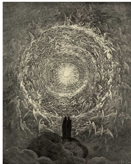
The Heavenly Host by Gustave Dore

Yahshua Christ, who is at the right hand of God, having gone into heaven, after angels and authorities and powers had been subjected to Him.