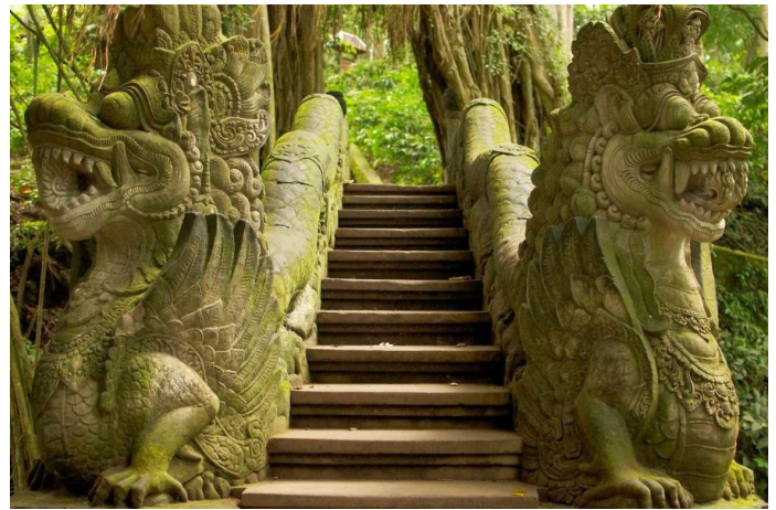
Staircase of the Winged Serpents, Bali, Indonesia

plowing his fields, and to direct three bands of Chaldeans to raid Job's camel herders. Yet we see that Satan did something even more remarkable in its appearance. At the precise moment of his choosing he caused fire from heaven to fall and burn up Job's sheep and those tending them, and to direct a whirlwind on a perfect course to strike the home in which Job's children were gathered. It certainly seems within the power of this "mighty one" to exert an influence over a serpent so that this beast would communicate his message to humanity's first forbears.