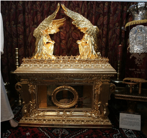
Replica of the Ark of the Covenant

Having addressed the identity of the serpent, and the heavenly being that was influencing/controlling it, we can now turn our attention to identifying what type of being Satan was and is.