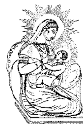
INDIAN GODDESS DEVKA AND INFANT KRISHNA