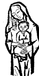
ROMAN CATHOLIC MARY AND GOD-INCARNATE JESUS