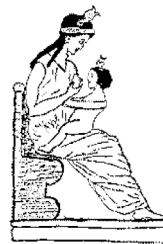
EGYPTIAN GODDESS ISIS AND SON HORUS