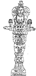
GODDESS DIANA OF EPHESUS