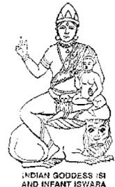
INDIAN GODDESS ISI AND INFANT ISWARA