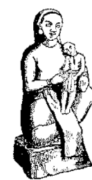
BABYLONIAN GODDESS SEMIRAMIS AND GOD-INCARNATE SON

Christmas and Easter are both traceable back to ancient Babylon. This worship of the fertility goddess, and her son, who is figured as her husband reborn, is found throughout the nations of the earth.