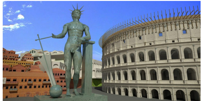
Roman Colosseum and Statue of Sol Invictus, the Sun-god

However, this was NOT the reason that Constantine legislated that the weekly day of rest and worship in Rome would be Sunday. Constantine described this day ( dies Solis ) as “the venerable day of the Sun (not Son).” Just six years prior to this edict, Constantine had a triumphal arch constructed in Rome. It was positioned to align with the colossal statue of Sol Invictus by the Colosseum. As the people approached this arch down the major thoroughfare leading to it, they would find framed behind the arch the image of Sol Invictus, the deity known as the Unconquerable Sun.