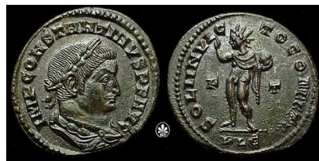
Constantine and Sol Invictus

Although the statue of Sol Invictus no longer remains, it is apparent that Constantine intended to draw attention to this deity, and to demonstrate his devotion to it. Constantine also had coins minted with his own likeness on one side, and an image of Sol Invictus on the reverse.