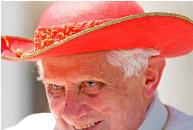
Pope Benedict XVI Wearing Saturno