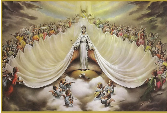
Mary - Queen of Heaven

of Heaven. Never did any Greek or Roman deity receive greater veneration and worship than the Roman Catholic Mary.