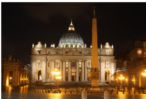
St. Peter's Basilica at the Vatican

It was a remarkable transformation that Satan wrought when he transformed the face of Christianity from a collection of common people led by fishermen and other tradesmen (apostles and teachers without costume or buildings), men whose only religious heritage came from the pages of the Old Testament, morphing them into the abomination that was to become the Roman Catholic Church.