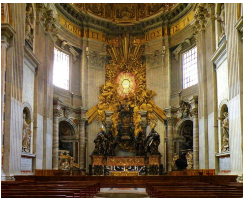
Throne of Saint Peter (Latin Cathedra Petri )

The foundation stone for Saint Peter's Basilica was laid in the year 1506. Pope Julius envisioned building the grandest building in Christendom. He initiated a competition to come up with a design for this audacious building. The winner was Donato Bramante whose design resembled an enormous Greek cross with a massive dome patterned after the Pantheon. This seems fitting since the Roman Catholic Church has from its beginning been a profane and idolatrous mixture of the worship of many deities.