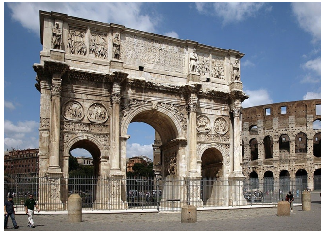
Arch of Constantine and Roman Colosseum Today

Although the statue of Sol Invictus no longer remains, it is apparent that Constantine intended to draw attention to this deity, and to demonstrate his devotion to it. Constantine also had coins minted with his own likeness on one side, and an image of Sol Invictus on the reverse.