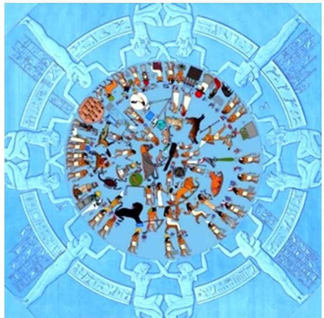
Zodiac of Denderah

The heavens have from ancient times been represented as a dome. Following is an image of the famous Zodiac from the temple complex of Denderah, Egypt. It has been colored to match the original appearance when it was constructed, possibly in the first century B.C..