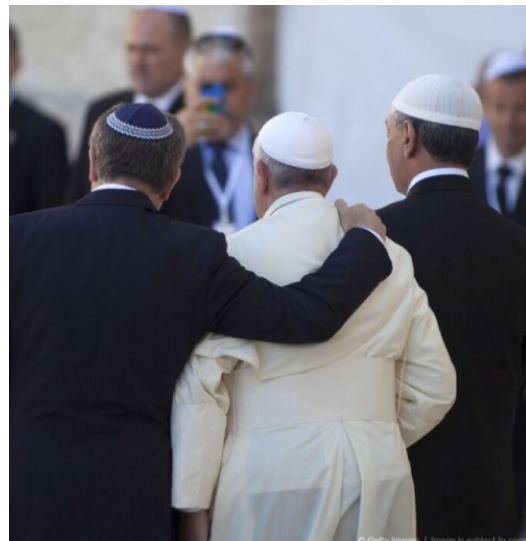
Pope Francis with a Jewish Rabbi and Muslim Cleric

Although the focus of this book is not Roman Catholicism, much can be discerned about Satan’s success in corrupting Judaism as one looks at the abomination of Rome which is Satan’s corruption of Christianity. Talmudic and Kabbalistic Judaism has departed as far from the faith of Abraham and Moses as Roman Catholicism has deviated from the faith of the apostles of Christ. Satan has been successful in suborning both Judaism and Christianity. In many instances he has introduced identical elements of his Luciferian worship into both groups. One of the most visible evidences of this common adoption of Satanic symbols are the caps worn by both the Roman Catholic clergy and Jewish believers.