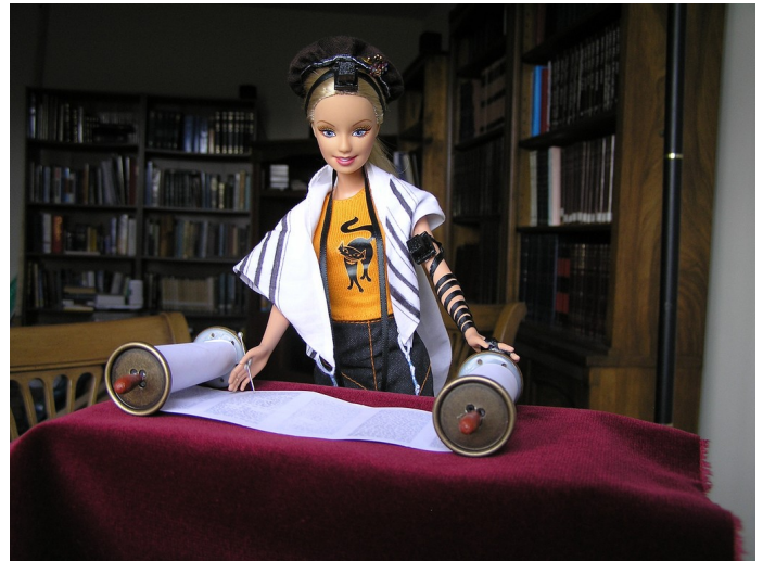
Barbie Reads the Torah

If it is a grievous error for the nations to seek to fulfill a role only Yahweh can provide for Israel, is it not also error for Christians to stretch out their hands for good or for evil toward this nation? If Yahweh has not commanded it, it should not be done. Should the disciples of Christ support those who are anti-Christ, or lend their political support to the Zionist nation founded by the Rothschild’s and their ilk? Let me put it this way. If a group of witches came to your church and asked for your financial support and prayers, would you give it to them? Would it make a difference if these practitioners of Satanic arts were all Jewish? Would their Hebrew heritage make them acceptable in Yahweh’s sight? No! You might well pray for their salvation, but it would be great folly to give them your money and to endorse their actions.