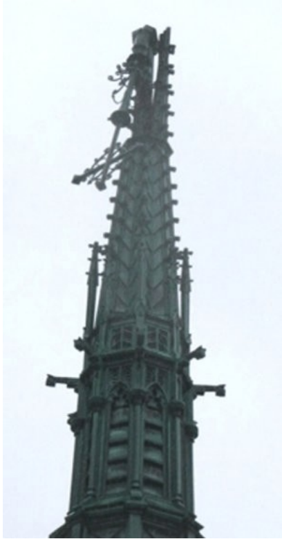
Steeple - Central Lutheran Church, Minneapolis

In this blog, it has been noted that in the past year many steeples have been toppled by acts of God. It is there that judgment must begin.