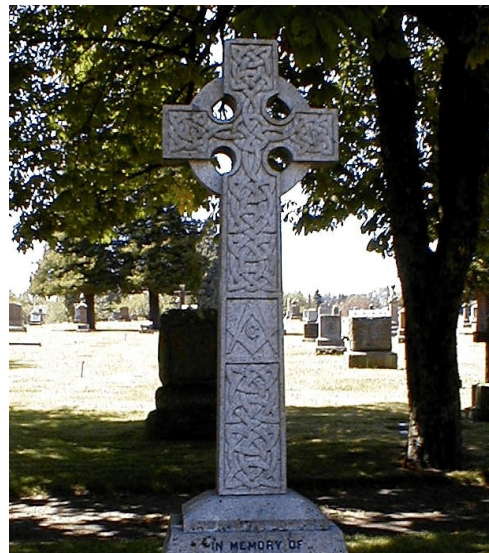
Celtic - Solar Cross (Note Freemasonry symbol in the center)

Thus, we see in the layout of Vatican City the ancient symbols for all three members of the Babylonian trinity. The solar cross has from ancient times been the symbol for Tammuz, who in the Babylonian fertility cult was Nimrod reborn as the Sun god. Semiramis came to be associated with the Moon. Thus, the worship of the Sun and Moon were a central part of this religion that spread throughout all nations of the world.