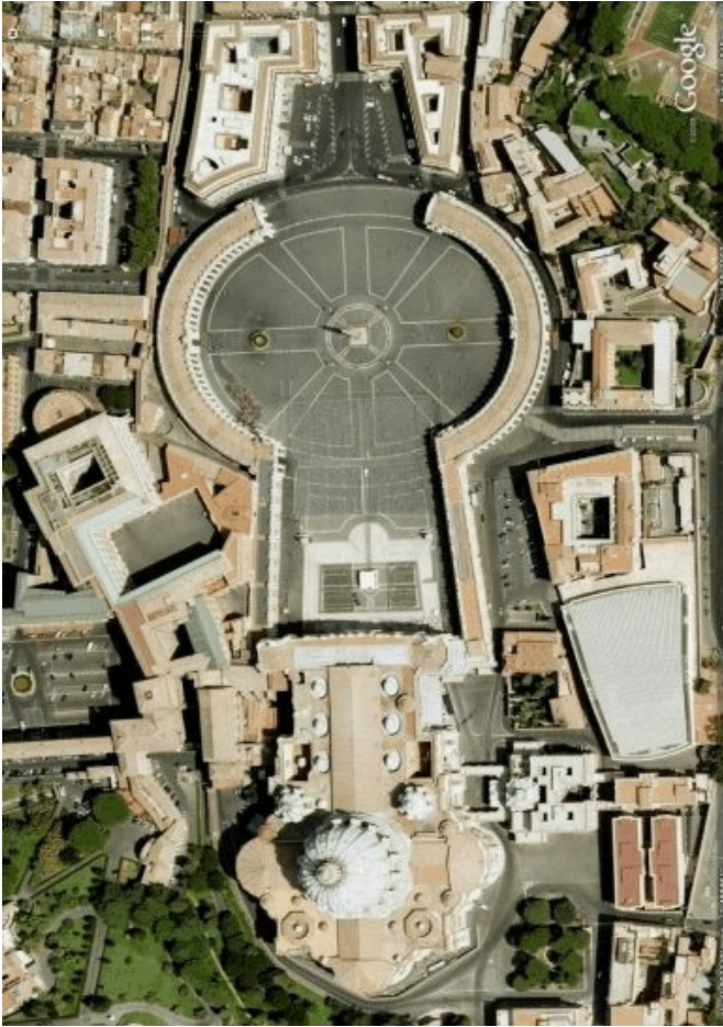
Aerial View of St. Peter's Square

And just as in the stele from the Bardo museum, the obelisk symbol of Baal is set in the center of the ellipse that forms the top part of Tanit's emblem.