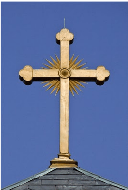
Detail of cross atop church in Missouri

Yahweh's instructions to His holy people Israel, were that they were to completely destroy all the images and pillars they found in the land that had been used in the worship of the host of heaven.