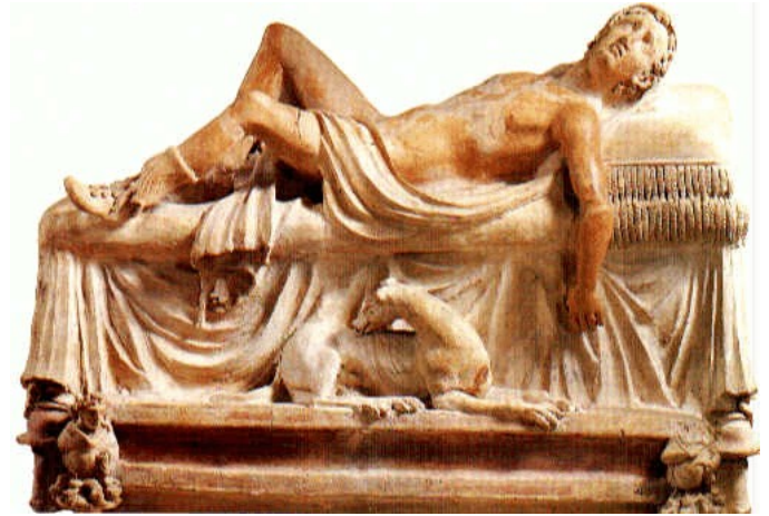
Image of Tammuz - Greek Adonis - Dying

the day Tammuz the son of Ishtar (the Babylonian Semiramis) was said to be resurrected after he had been slain by a wild boar.