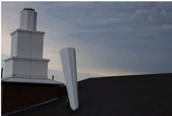
Salina Kansas, First Baptist Church Storm Damage

Please understand my intent in sharing these things. I do not believe the church will be purified by focusing upon the removal of all the symbols of Babylonian origin that they have embraced. I sharing these things to suggest to you that the church has adopted much that has arisen from impure sources, and this includes the doctrines of the church. The apostles prophesied that this would be the condition of the last days church before the return of Christ.