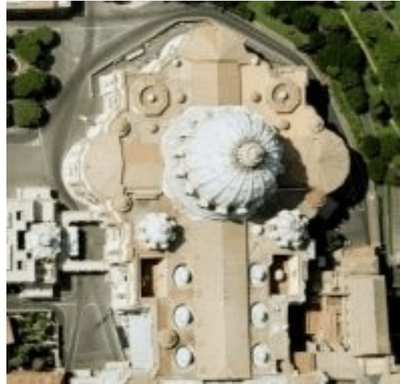
St. Peter's Cathedral - A Solar Cross

Note also what is at the bottom of the Tanit symbol. The cross shaped building with the sunburst image in the center of it is St. Peter's Cathedral.