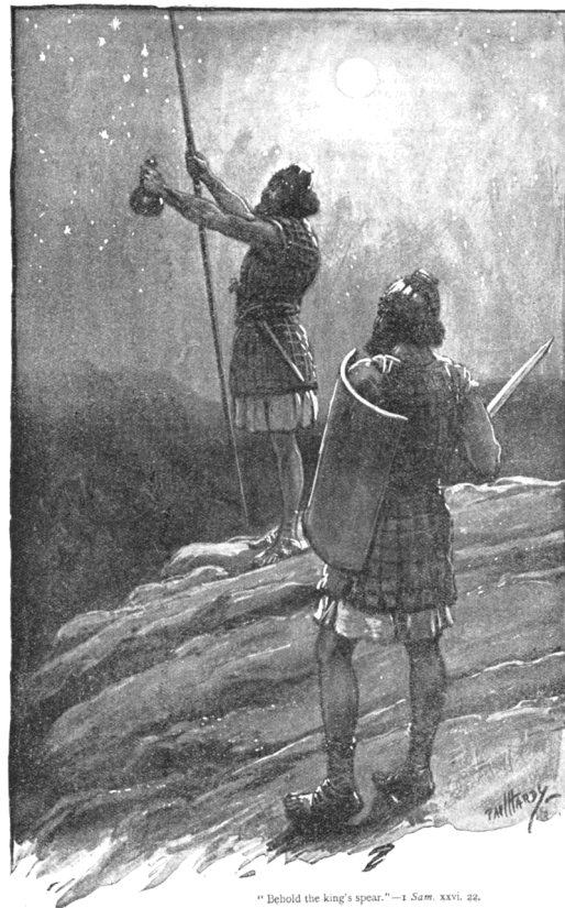
“Behold the king’s spear.”—1 Sam. xxvi. 22.

As Christians, we are not to judge things by appearances. This is a most difficult thing to learn. We must place no confidence in the flesh. We must not think that we can discern anything correctly unless we have heard from God. We need to learn the practice of seeking the counsel of God in all things, even those things that seem readily apparent. There are times when Satan will tempt us with things that seem so extraordinary, that we will assume they have come from God, for they may be an answer to some inner desire, or appear to be the very answer we need to some critical need in our life. At such times we must be very patient, and wait upon God to know His counsel.